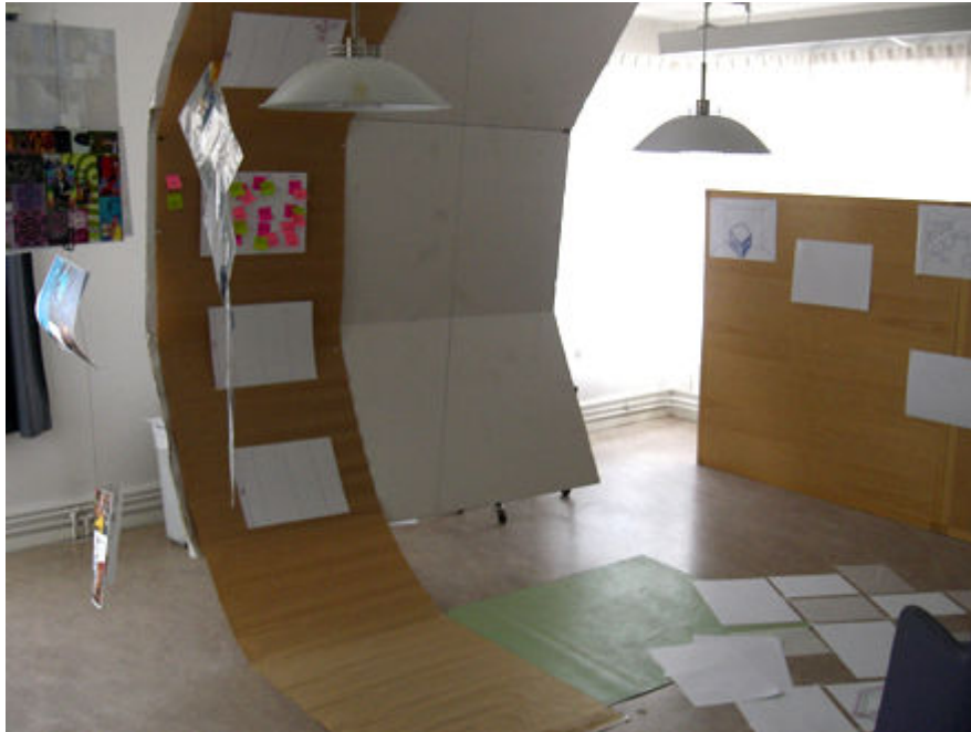
Lo-fi prototype of the environment.